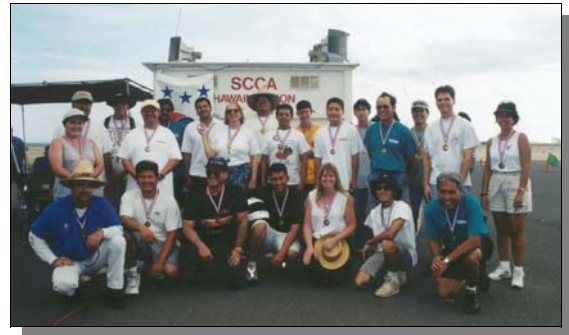
The Gold Medal winners

Congratulations to all the participants in our 4 th Aloha State Games competition. There was a lot of good racing and I can't wait to see more so I'll see you at the races!