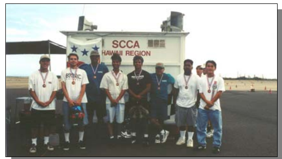
The Bronze Medal winners