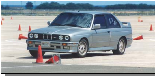
Joyce Hsieh drove her to BMW M3 to four constant runs in the mid 70's in a suddenly crowded A Stock class.

Use these runs to take a passenger or have a more experienced driver give you some pointers. You'll be amazed what you can learn from riding with someone else!