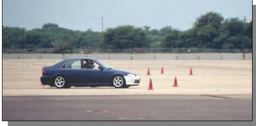
For a novice, Cal Sato drove well, placing right in the middle of the ultra competitive C Street Prepared

to make an error that would cost the driver valuable time. These elements were the technical part of the track. The short slaloms and fast straights gave the track its pedal-to-the-metal value.