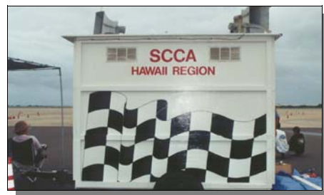
Our newly refurbished timing stand.

December's track was technical yet it allowed people to gain some speed. It contained two back-to-back 90° turns but actually the second turn was a 120°. The